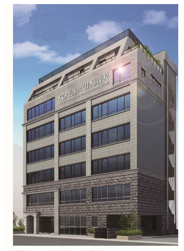
KCP Campus in the heart of Tokyo

I expected to be able to hold basic conversations in Japanese by the end of the program, but I was actually surprised. I became able to participate in quite complex conversations with most of my Japanese friends.